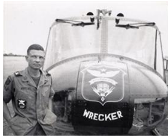
Then Army Major Charles Kettles stands in front of a 121st Aviation Company UH-1H Huey helicopter during his second tour of duty in Vietnam in 1969.

Do not miss this!! Bring guests!!! All are welcome!! This should be our largest Chapter gathering ever!!!